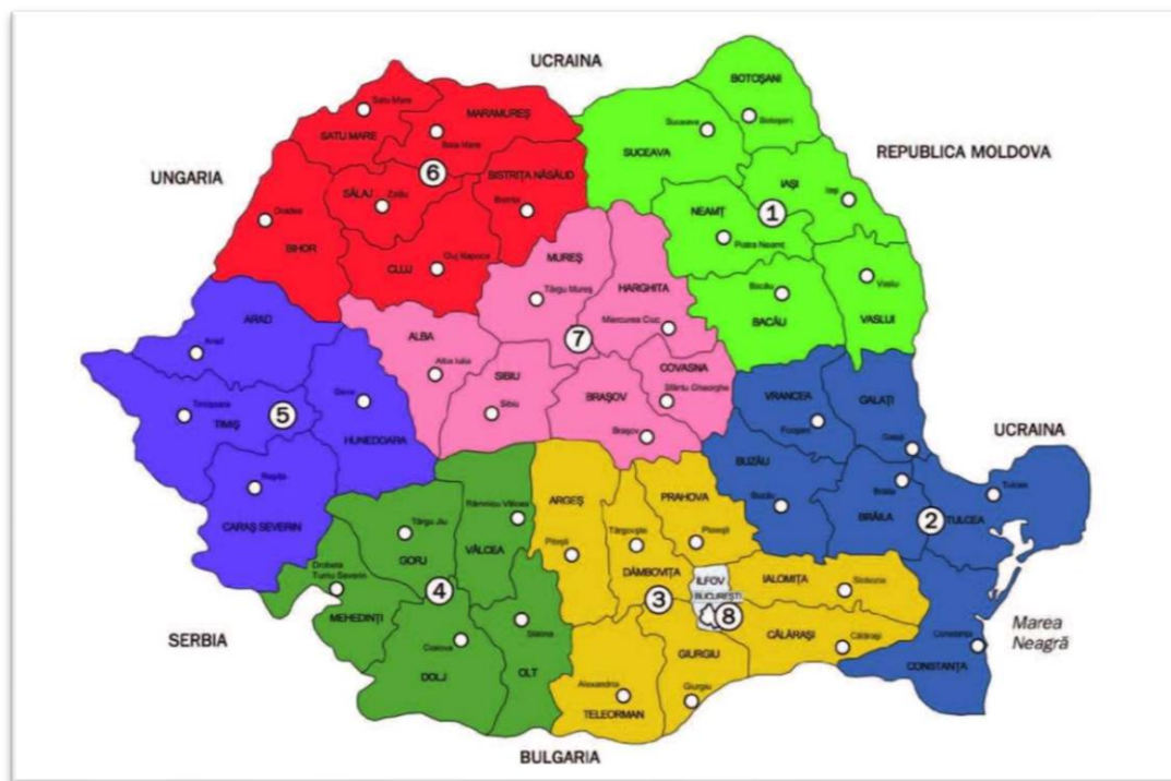
Fig. 3- Romania's current development regions

of starting the negotiations on the adoption of the acquis communautaire , the regional development policy became an important component on Romanian Government's agenda. Consequently, the 151/1998 law adopted the creation of 8 development regions (see Fig. 3) designed according to European NUTS II level, which were reconfirmed by law no. 315 in 2004. Neither of these regions are territorial administrative units, nor do they have legal personality, but the entire regional framework was configured around them so that Romania was able to attract European financial assistance. 25 According to Dobre, these regions are voluntary associations of four to six counties that serve solely statistical and regional development purposes legitimizing the current distribution of competences between central and local levels of government. As such, they do not possess any political, fiscal or policy-making powers. 26 Moreover, these regions were not founded on any historical, cultural, or geographical grounds and cannot claim having any cultural identity that is usually a prerequisite for the creation of a region. 27