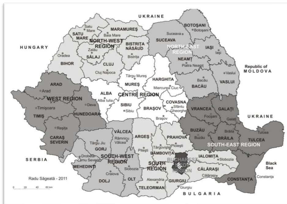
Fig. 1-The territorial administrative organization of Romania (1968-present)

A new organization of the state's territory comes in 1974 with the promulgation of law no. 58 on the territorial systematization of urban and rural areas. This law aimed to create a balanced distribution of the productive forces according to the centrally planned economy idea determining a forced industrialization and a pseudo- suburbanization that lead to the destruction of millions of households, most of them in rural areas. 19