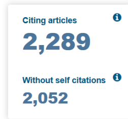
Sum of Times Cited per Year