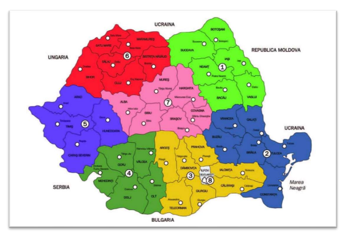
Fig. 3- Romania's current development regions

of starting the negotiations on the adoption of the acquis communautaire , the regional development policy became an important component on Romanian Government's agenda. Consequently, the 151/1998 law adopted the creation of 8 development regions (see Fig. 3) designed according to European NUTS II level, which were reconfirmed by law no. 315 in 2004. Neither of these regions are territorial administrative units, nor do they have legal personality, but the entire regional framework was configured around them so that Romania was able to attract European financial assistance. <sup>25</sup> According to Dobre, these regions are voluntary associations of four to six counties that serve solely statistical and regional development purposes legitimizing the current distribution of competences between central and local levels of government. As such, they do not possess any political, fiscal or policymaking powers. <sup>26</sup> Moreover, these regions were not founded on any historical, cultural, or geographical grounds and cannot claim having any cultural identity that is usually a prerequisite for the creation of a region. <sup>27</sup>