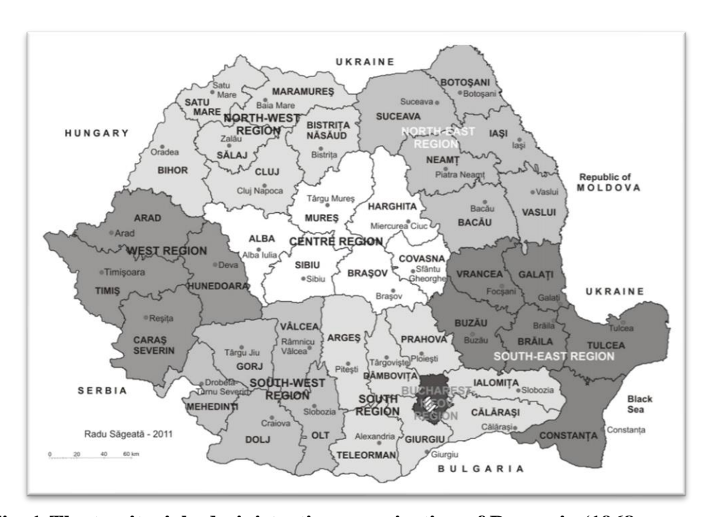
Fig. 1-The territorial administrative organization of Romania (1968-present) Radu Săgeată, Organizarea sdministrativ teritorială a României, Eevoluție. Propuneri de optimizare , Academia Română, Institutul de Geografie, 2013, p. 16.

A new organization of the state's territory comes in 1974 with the promulgation of law no. 58 on the territorial systematization of urban and rural areas. This law aimed to create a balanced distribution of the productive forces according to the centrally planned economy idea determining a forced industrialization and a pseudo- suburbanization that lead to the destruction of millions of households, most of them in rural areas.<sup>19</sup>